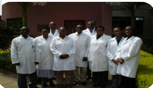
Lab team 2012

The current laboratory staffs at the institute consist of a Laboratory Director, senior laboratory technologists and support staff. All our staff are well trained.